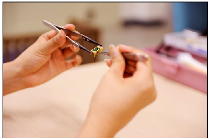
Semiconductor nanochip test package in a university nanotechnology laboratory.

Some examples of workplaces that may use nanomaterials include chemical or pharmaceutical laboratories or plants, manufacturing facilities, medical offices or hospitals, and construction sites. One way for workers to determine if their workplace is using nanomaterials is to ask their employer.