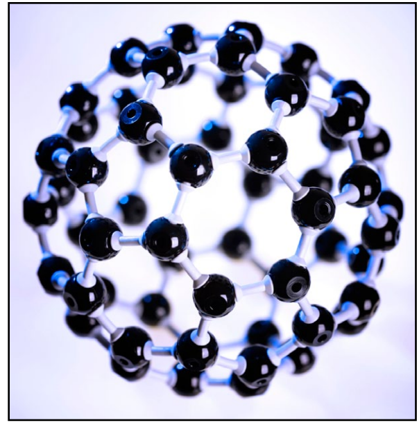
An example of a nanoparticle is a buckyball or fullerene.