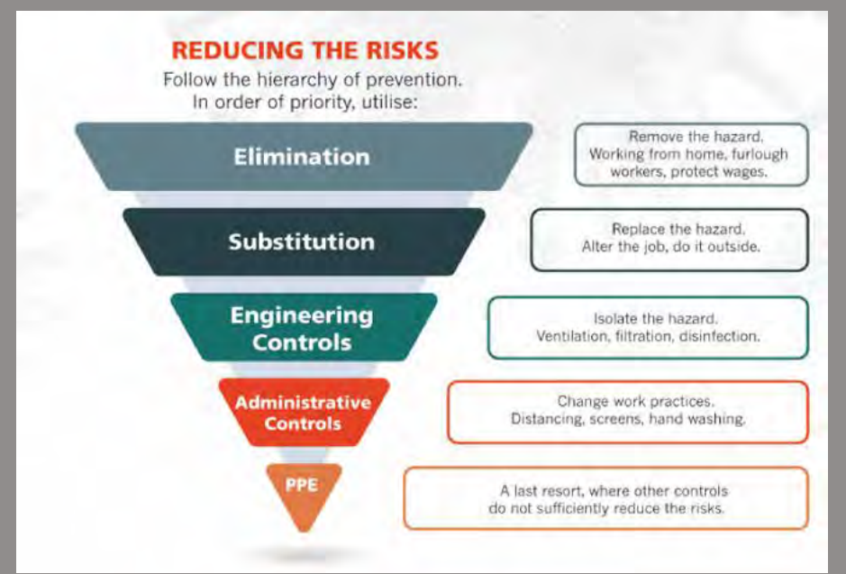
Hazards Magazine Venting: Coronavirus risks are moistly up on the air

More detail and support in GM Hazards Centre website on